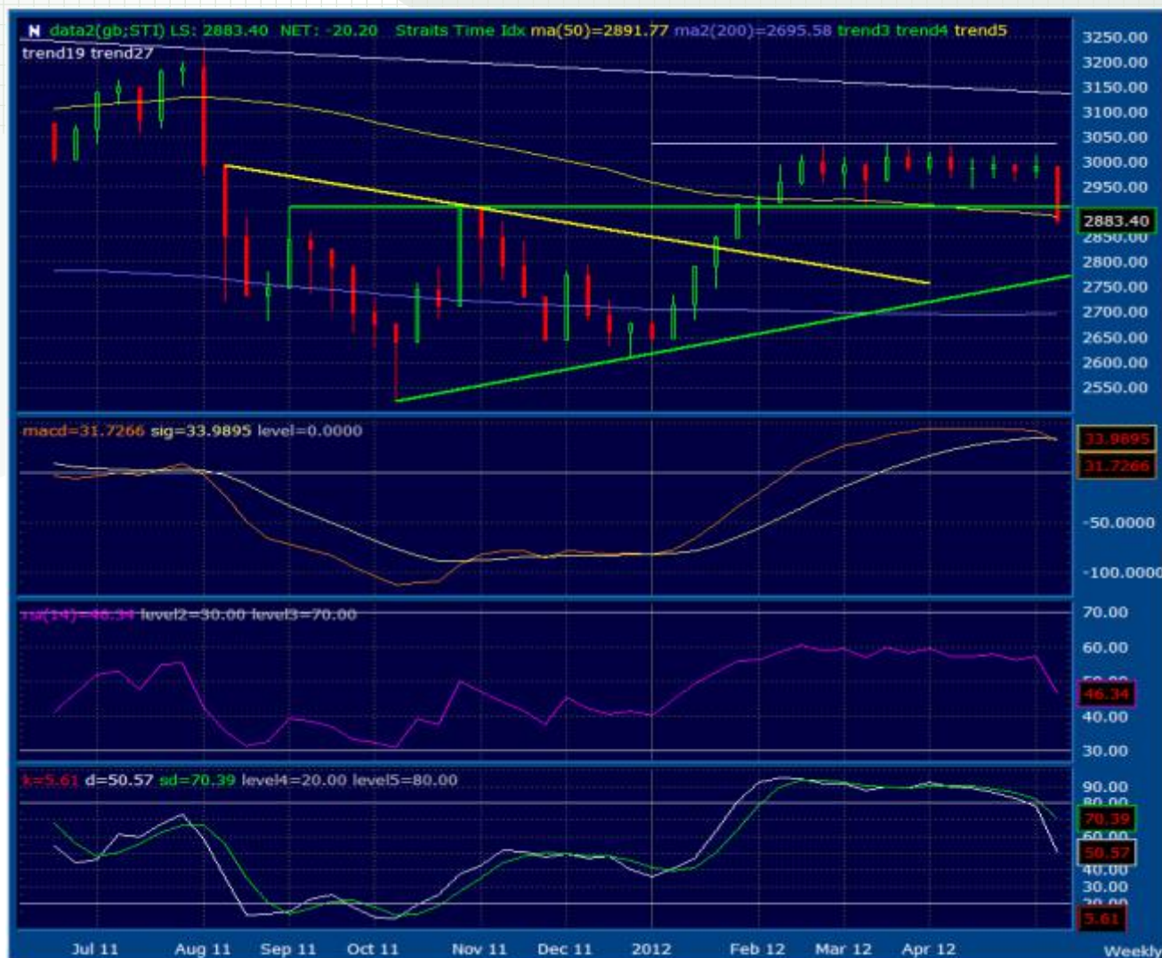
Figure: 1, Period: Weekly